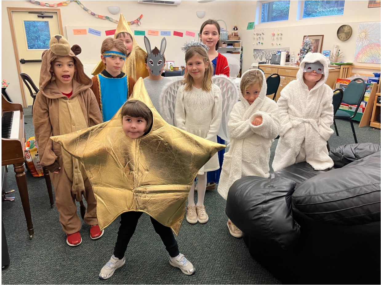
All ready to shine for the Christmas play!

I want to thank each of you for having confidence in me to coordinate this program. I am so honored and grateful. The children bring so much joy to me and to others. Thank you all for sharing them with us and bringing sparks to our lives.