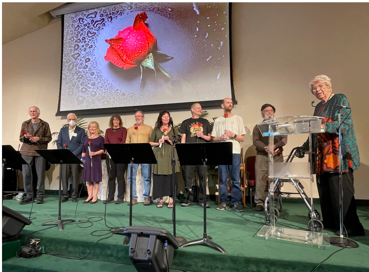
New Member Ceremony, Sunday, October 20, 2024.