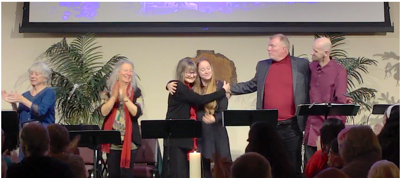
Singers at the end of our Christmas Eve Candle Lighting Service.

During 2024, CFTH produced fewer videos, and instead focused on developing its in-person Music, Meditation and Mental Wellness workshops. We are now presenting these workshops in a variety of settings, including Sponsors (works with formerly incarcerated individuals and their families), Serenity Lane (addiction treatment) and the Santiam Correctional Facility. Though CFTH is an independent 501c3 non-profit, it is a sister organization to UV, with a mutually beneficial relationship. UV allows CFTH to record in the sanctuary at no charge, and this gift is deeply appreciated. In turn, as CFTH succeeds and grows, it shines the spotlight back on Unity of the Valley, increasing awareness and helping to attract new congregants.